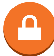
Virtual private gateway